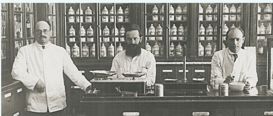
The Hadassah pharmacy brought western-style medicine to Palestine

Sadly, she didn’t live long enough to witness Statehood. Szold missed the party that could well have been held in her honour: one that celebrated the birth of Israel and the rise of a noble ideal where the sanctity of human life is enshrined.