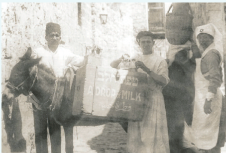
Donkeys were the ideal couriers in the alleys of Jerusalem

Much has been written about Henrietta Szold, yet for all the tributes that followed her death in 1945, few remember her.