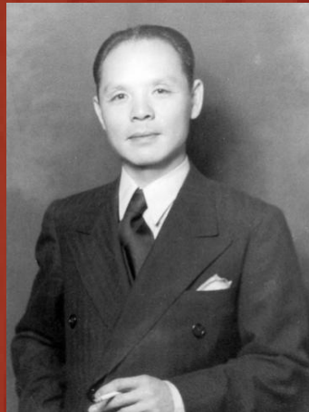
Feng Shan Ho

Foreign service personnel from many countries used their roles and acted to save Jews during the Holocaust, at the risk of their personal and professional lives.