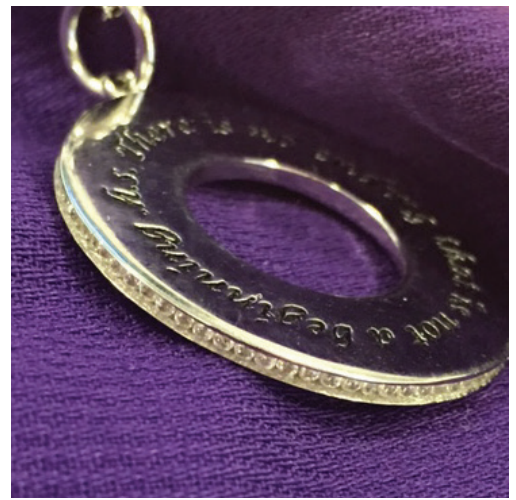
Photo enlarged to show detail.

For a gift of $150* in support of groundbreaking medical research at Hadassah Medical Organization, you can receive this lovely sterling silver necklace edged with cubic zirconias. It is inscribed with the famous quote from Hadassah's founder, Henrietta Szold, “There is no ending that is not a beginning.”