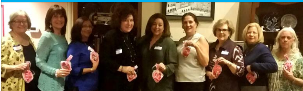
MA-ARAV GROUP BOARD INSTALLATION (LEFT)