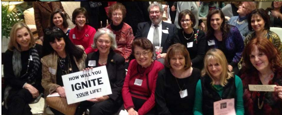
CHAPTER INSTALLATION (ABOVE & LEFT)