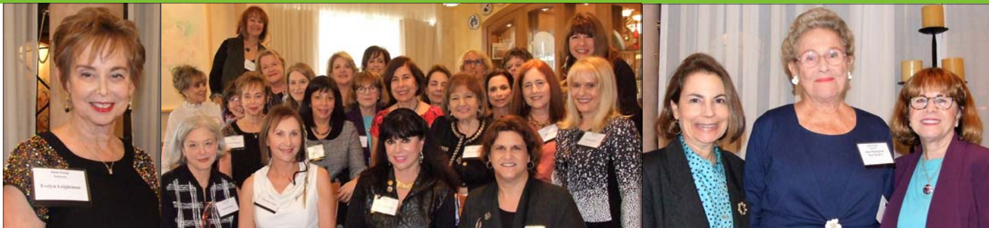
ANNE FRANK GROUP (ABOVE RIGHT AND LEFT)