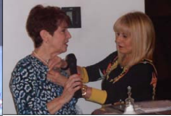
ANNE FRANK (ABOVE AND LEFT)