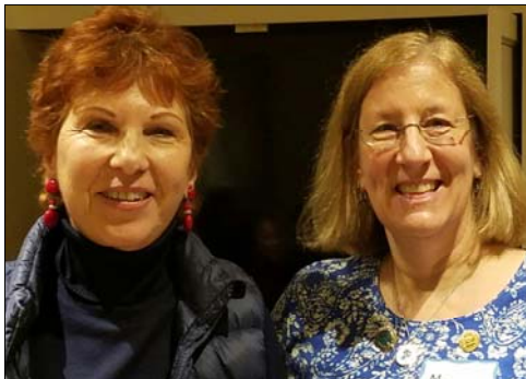
CHAGALL GROUP (ABOVE & LEFT)

Dress For Success: Bring your gently worn suits, business clothing, (cleaned and on hangers) panty hose, scarves, purses and shoes to the Hadassah office. The items will be taken to the Dress For Success office.