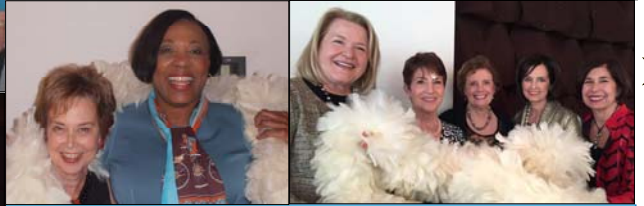
ANNE FRANK (ABOVE AND LEFT)