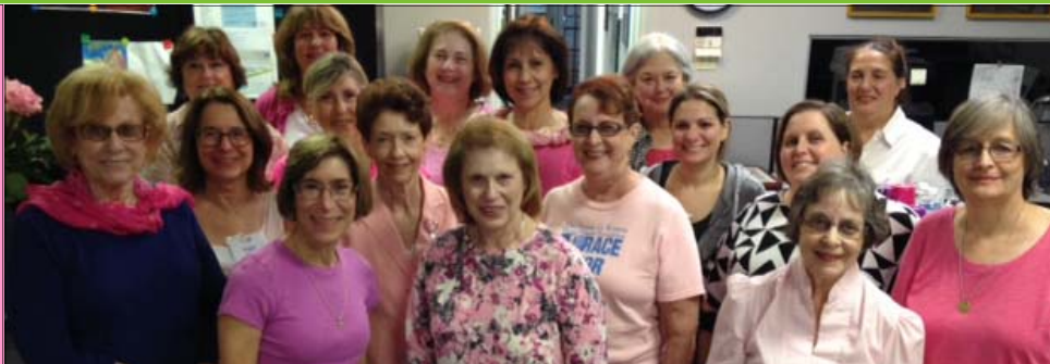
HOUSTON CHAPTER LEADERSHIP MEETING IN THE PINK FOR BREAST CANCER AWARENESS MONTH (RIGHT AND BELOW)