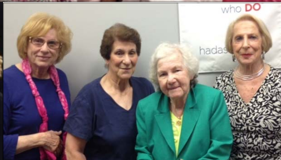
WISE GROUP MEETING (ABOVE)