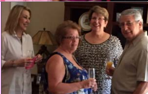
ANNE FRANK GROUP (RIGHT & BELOW)