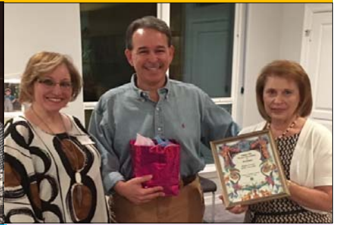
LAZARUS GROUP (ABOVE)