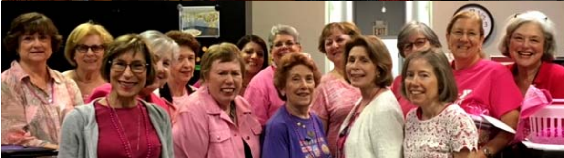
HOUSTON CHAPTER BOARD (LEFT)