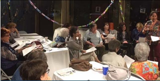
CHAGALL GROUP (ABOVE)