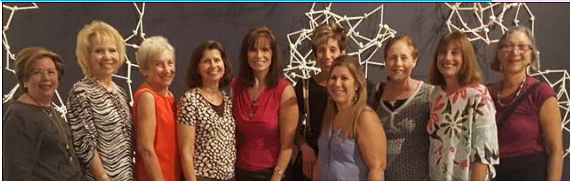
ANNE FRANK GROUP (LEFT AND BELOW)