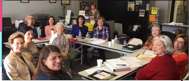
BIG GIFTS COMMITTEE (RIGHT)