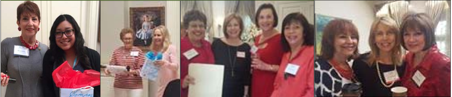
ANNE FRANK (ABOVE)