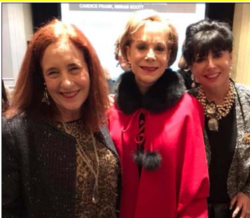
HADASSAH WOMEN AT JEWISH FEDERATION'S COLLAGE

PLEASE SEND AN UPDATE OF YOUR ADDRESS NEW OR TEMPORARY TO THE HADASSAH OFFICE AT RDORFMAN@HADASSAH.ORG