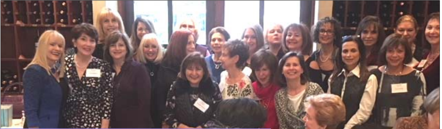
ANNE FRANK INSTALLATION & LUNCHEON (ABOVE & RIGHT)