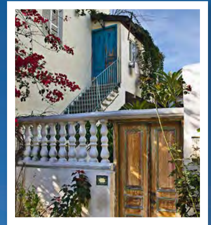
Old Tel Aviv

Overnight David Intercontinental Hotel in Tel Aviv