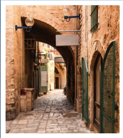
Old City Jerusalem