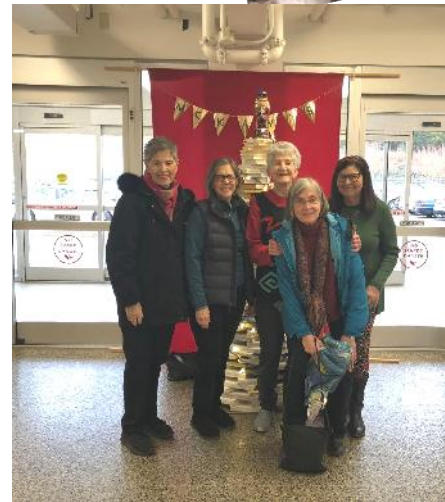
Holiday Gift Wrap Fundraiser at McKays Books