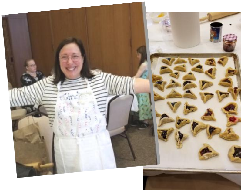
Hamantaschen Bake, Purim 2019