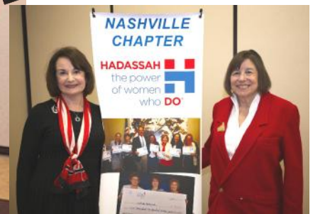
Installation of the new Nashville Chapter of Hadassah Board February 17, 2019