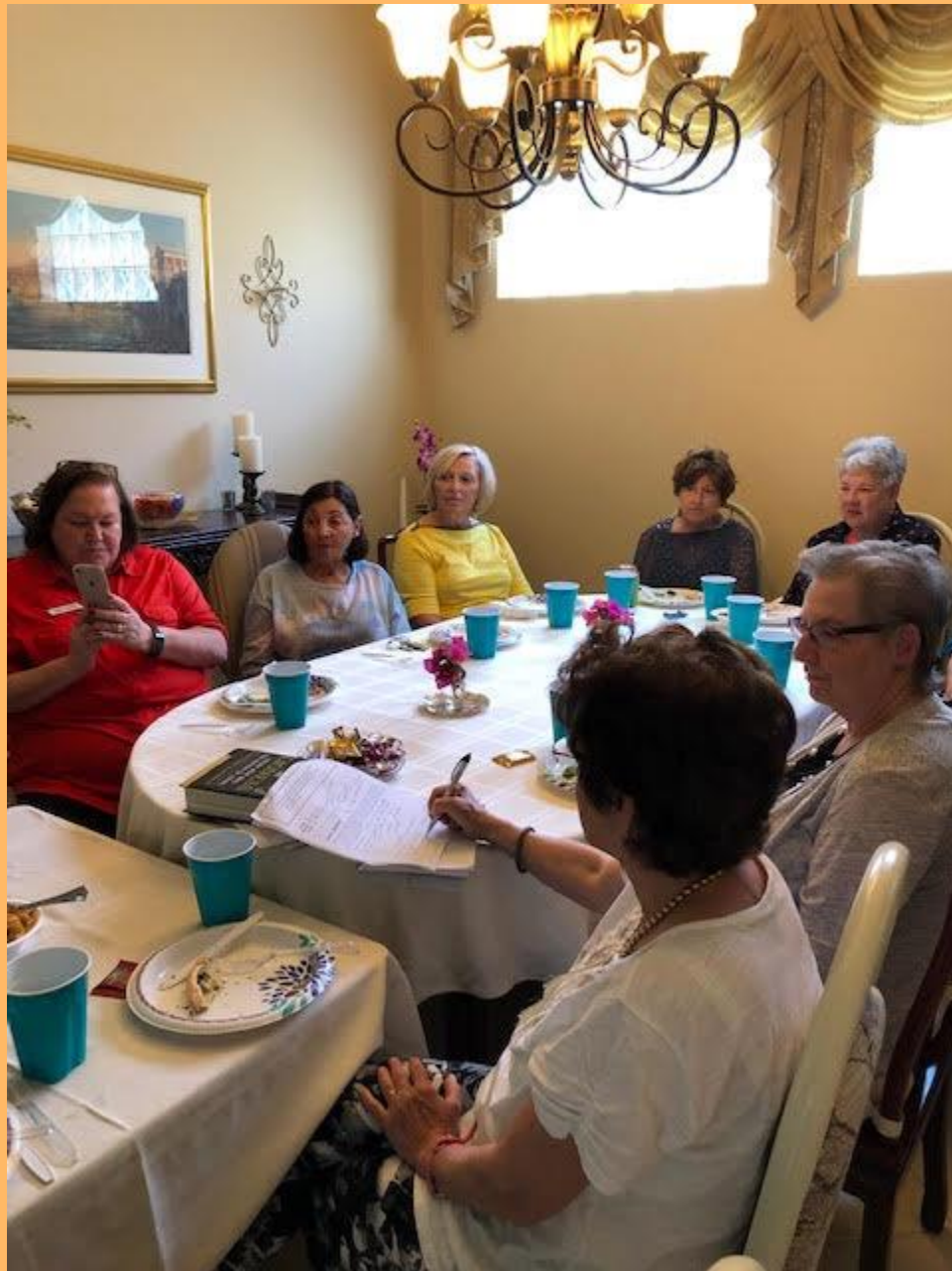
The Non-Fiction and More Bookclub met recently to highlight and discuss the life of Hadassah Founder Henrietta Szold.