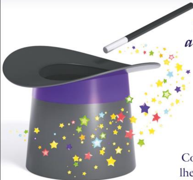
Table Captains and Sponsorships available