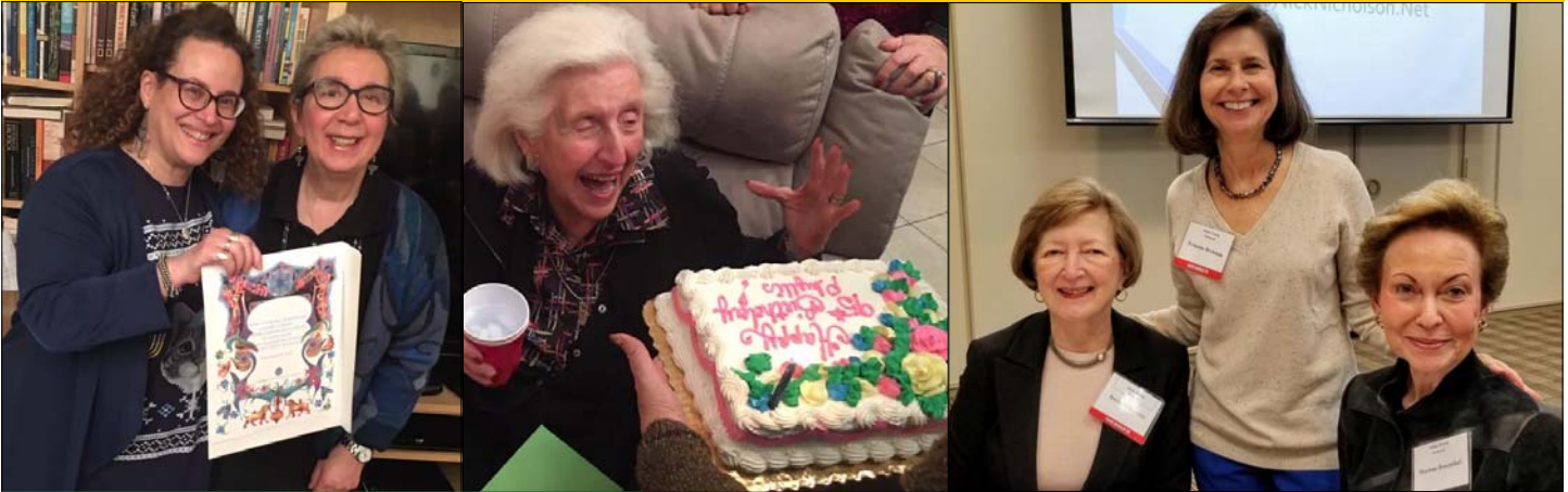
HAPPY BIRTHDAY CELEBRATION AND MARC CHAGALL GROUP (ABOVE!)